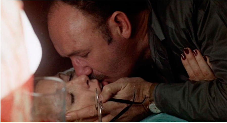
From The Conversation (Coppola 1973)