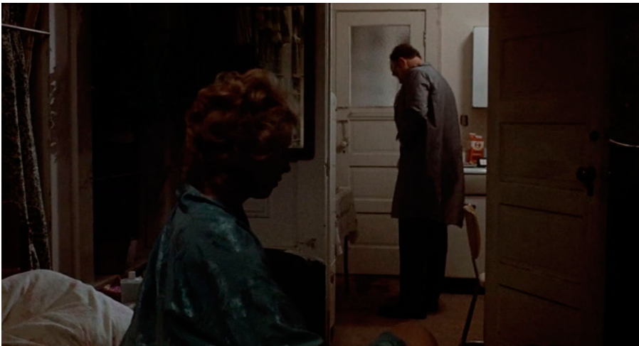
From The Conversation (Coppola 1973)

The complex conflict that exists between Harry and Amy, in which he seeks to have sex with her, and she seeks to find out more about the real man, is visually played out in their physical interactions. His constant attempts to kiss her; her constant attempts to avoid the kissing, in part through eating a biscuit. The screenplay suggests the conflict on one level, but that intimate physical interaction is not explicitly suggested in the screenplay. 16 While Bresson's final film does deviate very subtly from the screenplay, there is an attempt to describe as much of the detail as possible. In contrast, Coppola's screenplay leaves out almost all the visual and behavioural detail, which clearly reflects the way that he works with his performers in creating the final scene.