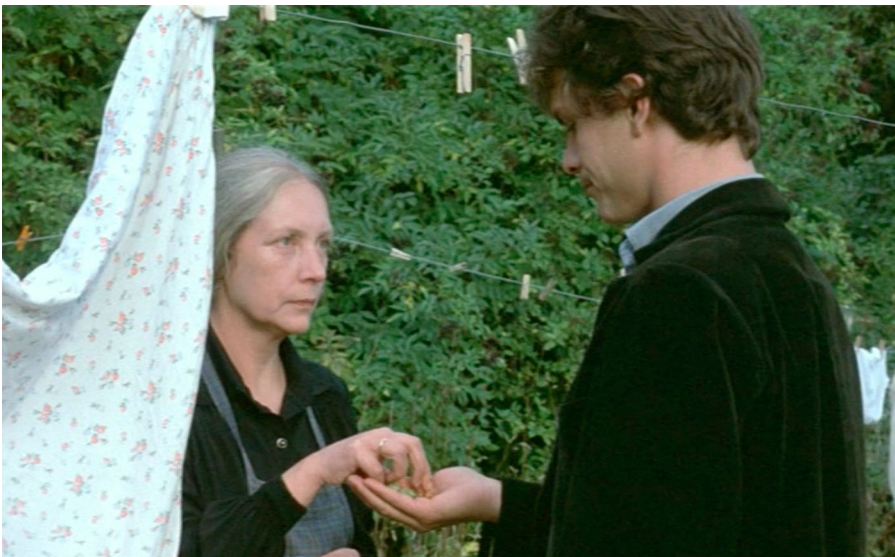
From L'Argent (Bresson, France 1983)