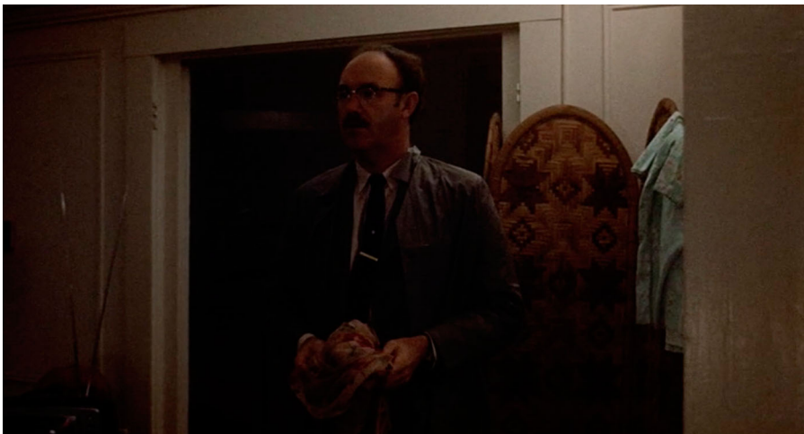
From The Conversation (Coppola 1973)

Here we see the classic example of how the screenplay is reduced to the bare dramaturgy of character dialogue and very very basic actions. Nowhere is there even a hint of the formal cinematic elements, nor, importantly for this discussion, the complex behavioural actions undertaken by the characters in this scene.