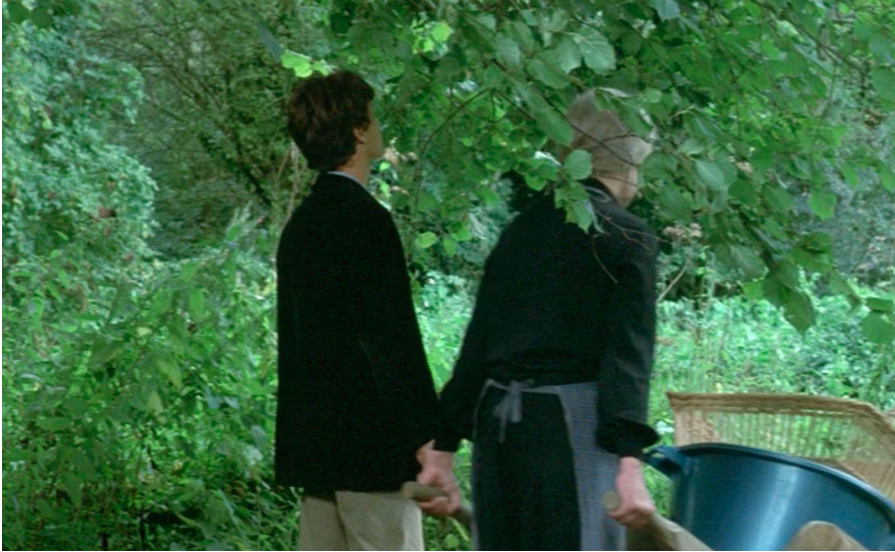
From L'Argent (Bresson, France 1983)

This detailed shot by shot screenplay, full of camera instructions and detailed descriptions of character movement in relation to the frame, is a far cry from how we tend to teach screenwriting. It would be easy to dismiss this approach as a director's shooting script – which it indeed is – but it is a reflection of how Bresson's formalistic philosophy and approach is guiding how he writes his screenplay. The line between director, writer and, indeed, editor is somewhat blurred. The writer in him, the director in him and the editor in him need to work together to conceive the form as the narrative only works in its holistic context. It is difficult to read this screenplay and get any sense of the power of the final film, largely because the dramaturgy of conflicting characters is not what is really driving this narrative.