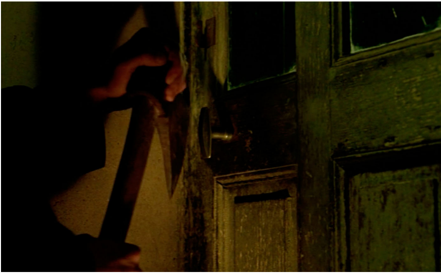
From L'Argent (Bresson, France 1983)

One could perhaps imagine how an investor, a producer, or a script editor with little knowledge of Bresson's visual style, approach and philosophy, would fail to understand the holistic cinematic potential of this narrative. Rather than emphasising the dramaturgical conflicts, character arcs and so on, that we have come to expect jumping from the pages of a screenplay, Bresson has focused on giving us as many of the directorial and editing components as he can reasonably provide on paper.